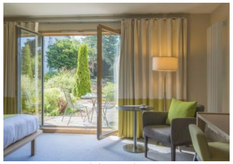
Ground Floor Garden Room