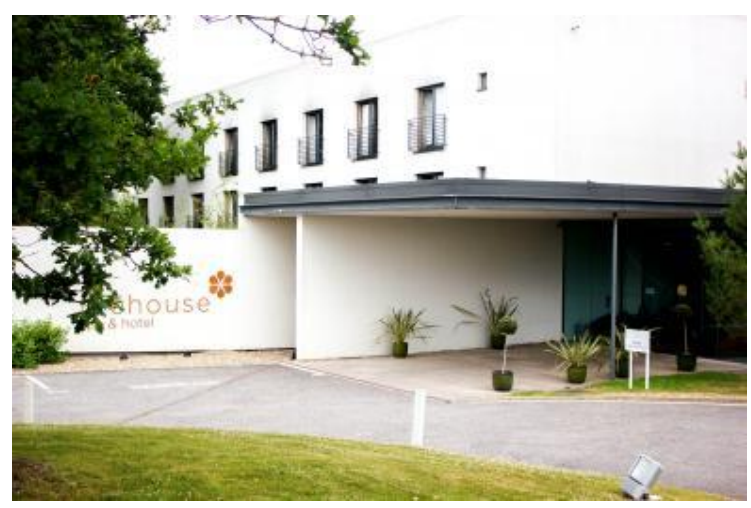
Entrance to Lifehouse