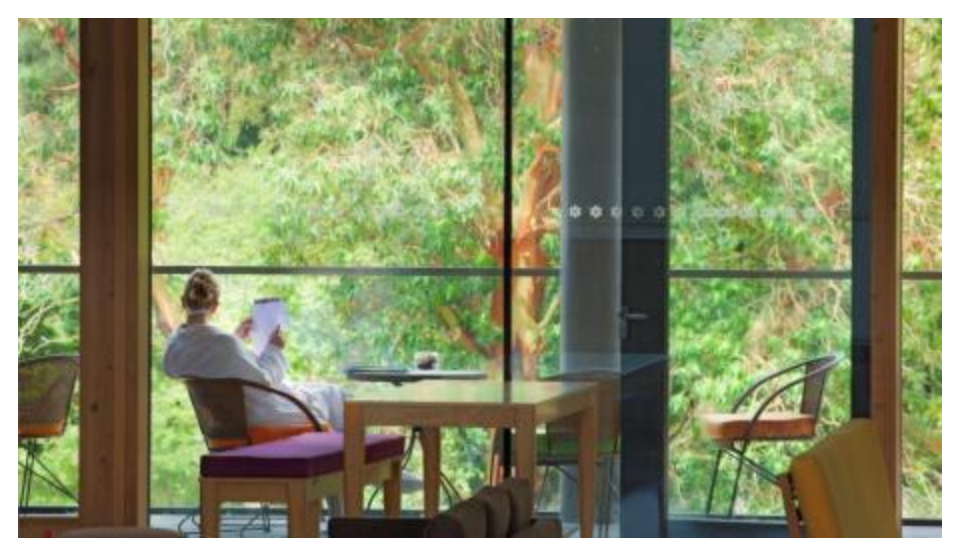
Daylight lounge with outside terrace