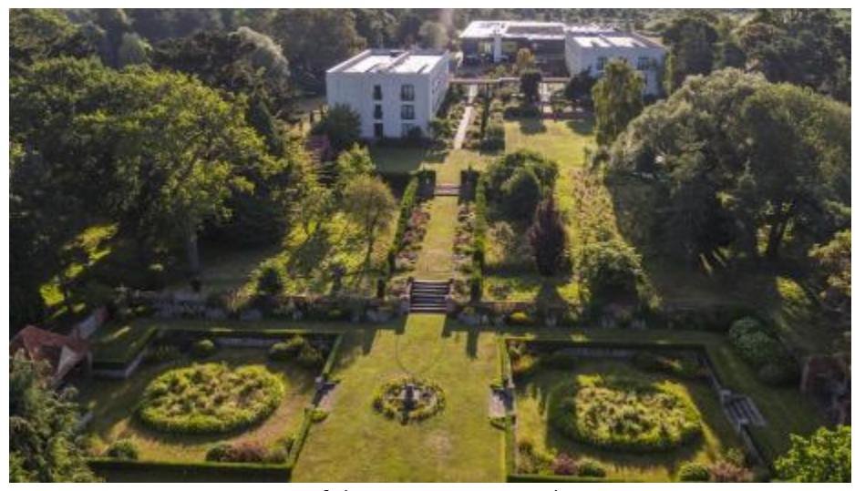
Lifehouse Spa & Hotel