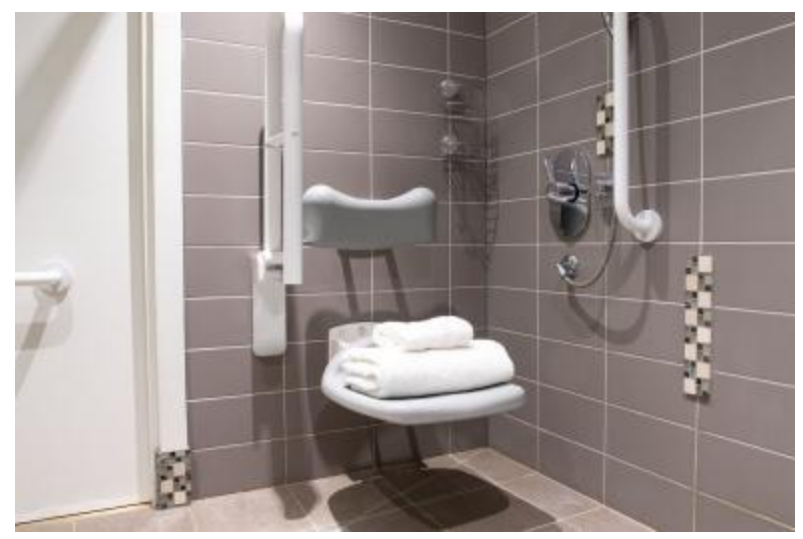
Accessible Room Bathroom